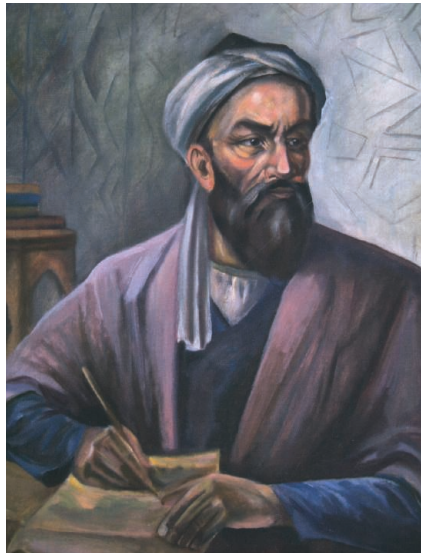
Biruni boldly sorted scientific fact from fantasy.

Most sensational of all may be Biruni’s “discovery” of America. For the purpose of precisely determining the qiblah—the direction of Mecca during Islamic prayers—Biruni meticulously recorded coordinates of the places he visited, and compiled data on thousands of other Eurasian settlements from other sources. After plotting out the known world—possibly on a 5-meter-tall globe he is said to have constructed—